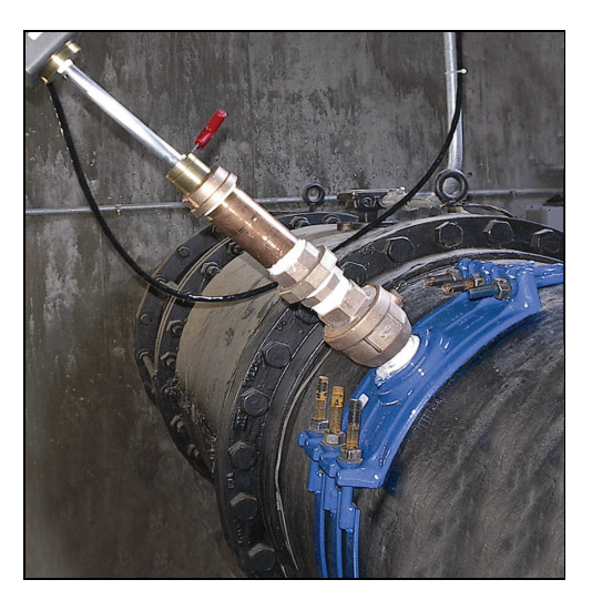
The ADFM Hot Tap sensor installs through a standard two-inch tap.

Teledyne Isco reserves the right to change specifications without notice. © 2009 Teledyne Isco, Inc. • L-2136 • 11/09