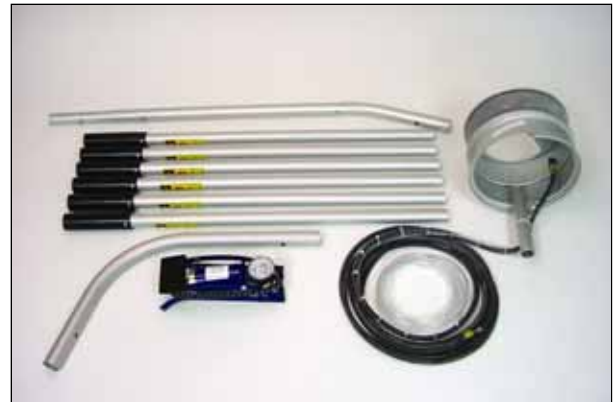
Above: Each kit comes complete with pole sections and pump for inflating the bladder. Below: positioning the metering insert into the upstream side of a manhole.