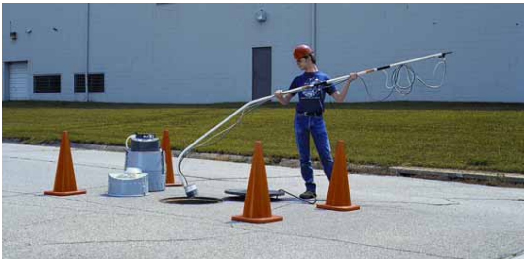
Flow Metering Inserts eliminate the costs and hazards of manhole entry and the need for weirs or flumes.

†Actual calibration test results available upon request.